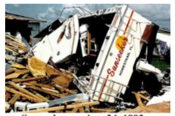
Sunseeker on Aug 24, 1992

Well it is that time of the year again, Hurricane season officially begins on June 1<sup>st</sup>, even thought we have already had one named storm out in the Atlantic. Those of us who were here for Andrew in 1992 probably think of ourselves as sort of Hurricane experts; however, it is good for all of us to review the marine hurricane preparation suggestions every year. The Miami Herald, in conjunction with BoatUS, recently published some tips for mariners. Of course, their first suggestion was that if all possible you should move your boat out of harms way. If you plan to do this, remember that the drawbridges are locked down when a Hurricane watch is issued or if an evacuation is ordered. According to the Herald, "By state law, owners of nontrailerable boats can't be forced to vacate marinas when a hurricane is approaching. They should leave, but if there's no place to